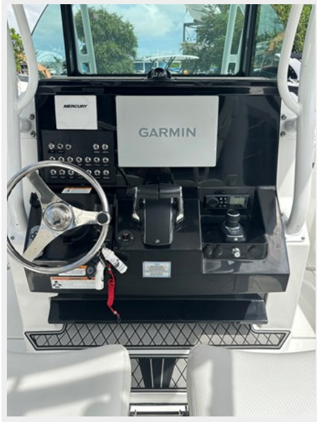
17. 302 helm