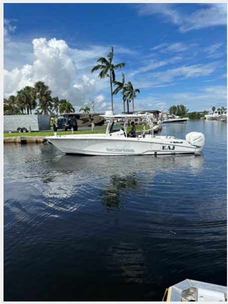
01. 302 cover shot