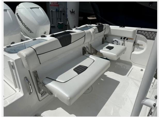
34. 302 jump seats