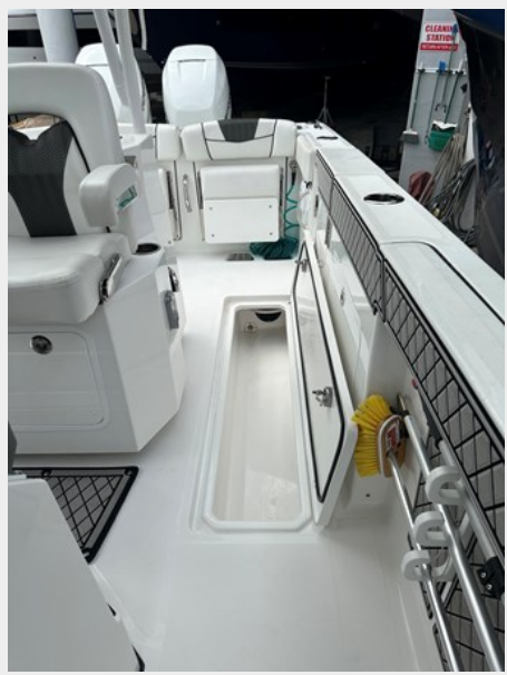
31. 302 fish box port