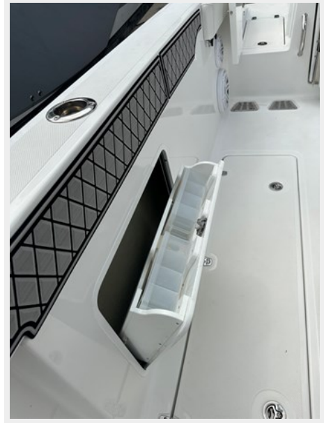
30. 302 tackle storage stbr