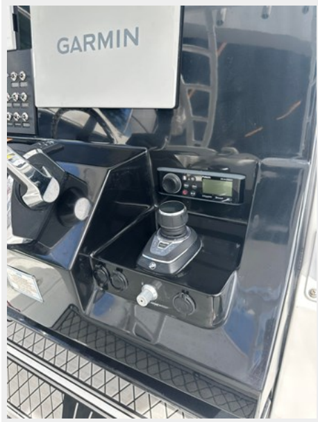
19. 302 joystick