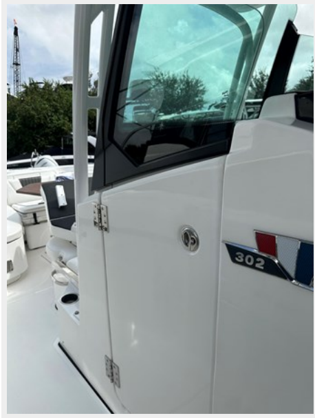
13. 302 head door closed