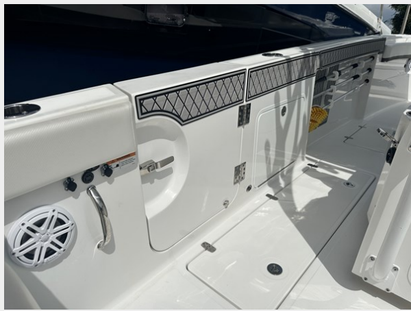
33. 302 dive - side door