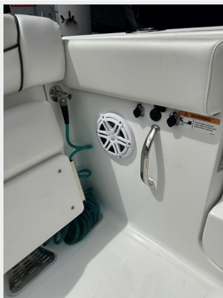
35. 302 wash down electric reel