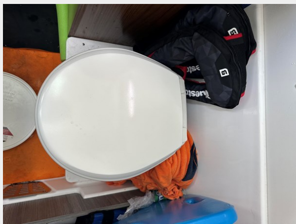
15. 302 porcelain head