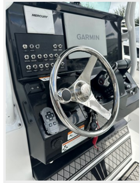
18. 302 port shot helm