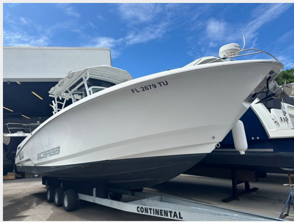
07. 302 shot on work trailer