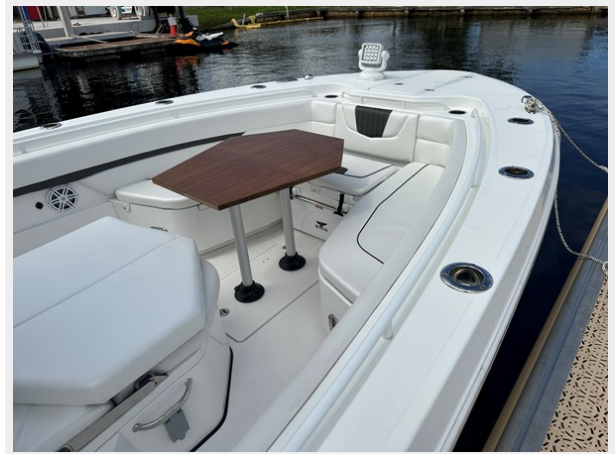
06. 302 bow table in water