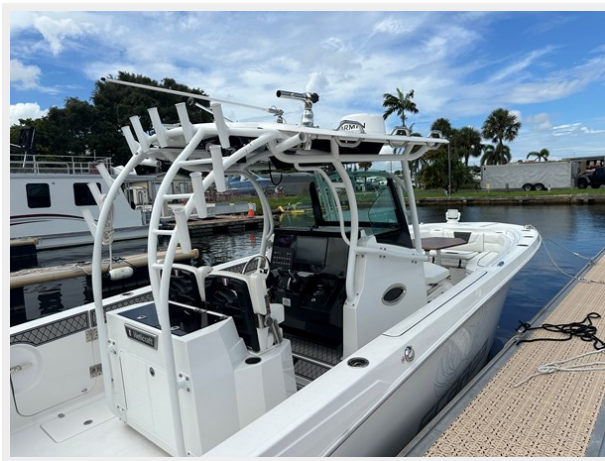
03. 302 stbr side shot at dock