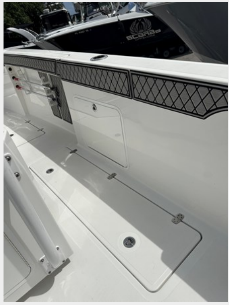
29. 302 stbr under gunnel