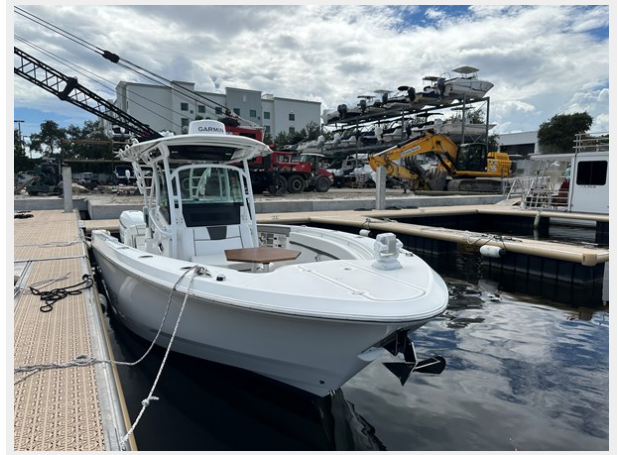
02. 302 bow shot at dock