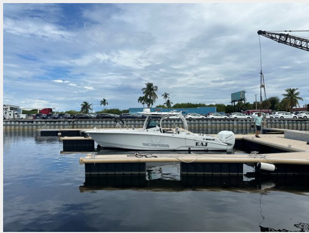
05. 302 side shot port at dock