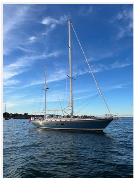
Stb Beam On Mooring