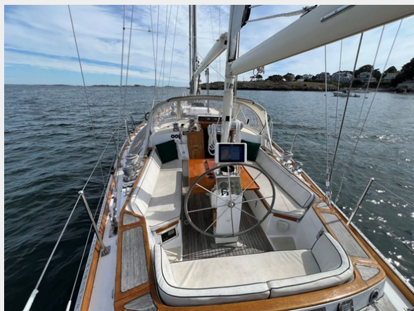
Cockpit Looking Fwd