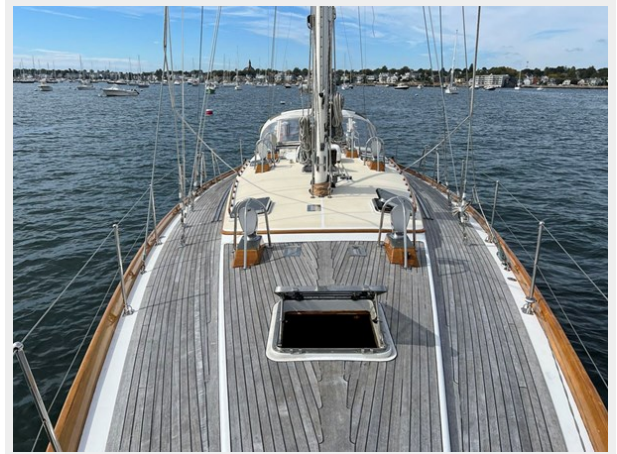
Foredeck Looking Aft