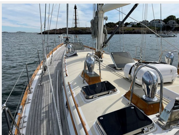
Port Side Deck