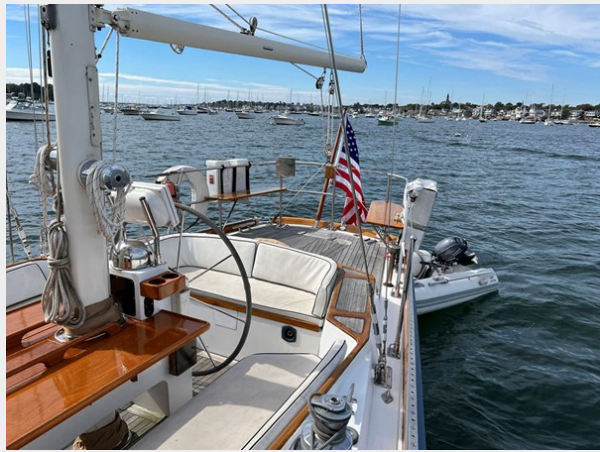
Aft Cockpit and Aft Deck