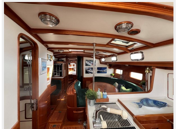
Salon and Galley Looking Forward