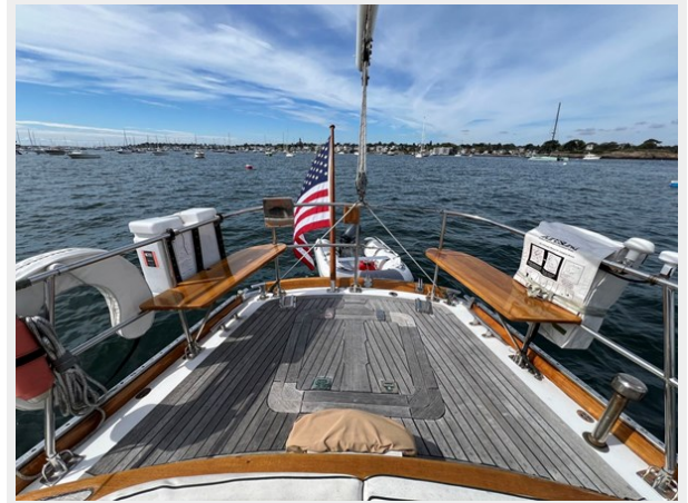
Aft Deck Looking Aft