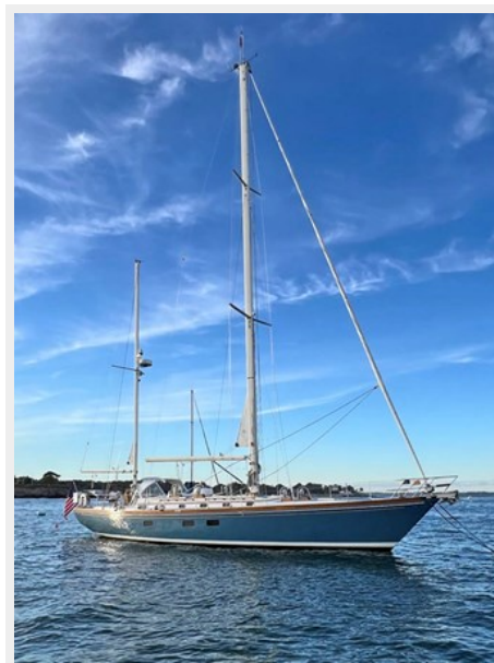
Stb Bow On Mooring