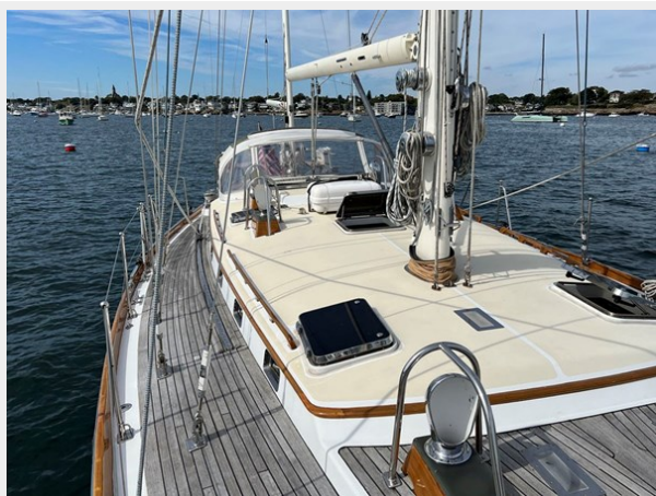
Mid Deck and Mast Base