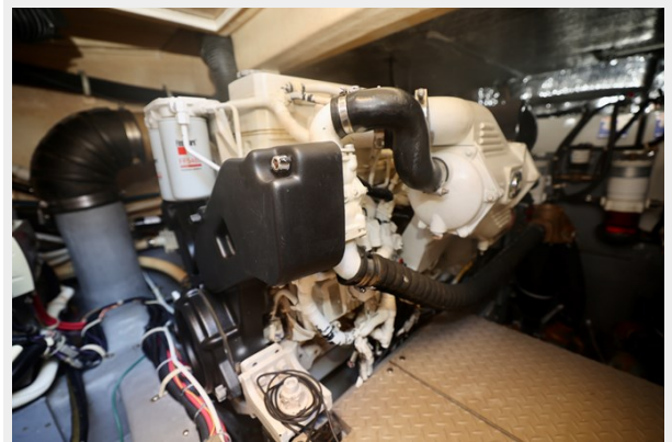
43 CARVER 2015 ENGINE