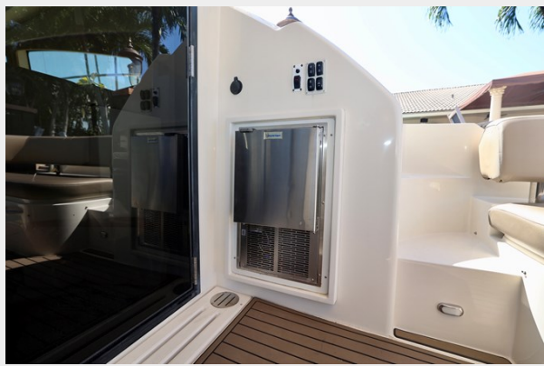
43 CARVER 2015 ICEMAKER