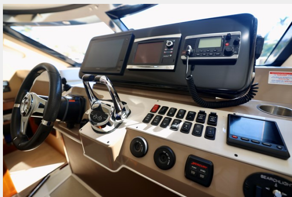
43 CARVER 2015 HELM 2