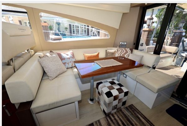
43 CARVER 2015 SALON SEATING