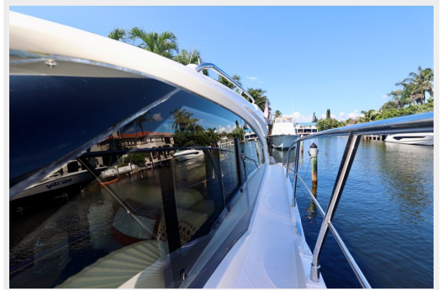
43 CARVER 2015 WINDOW DETAIL