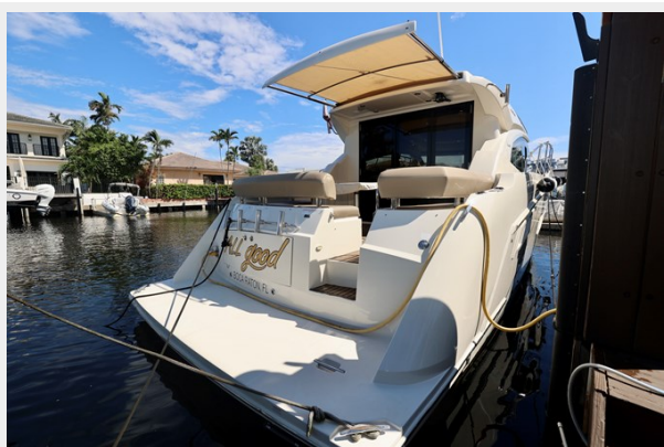
43 CARVER 2015 STERN