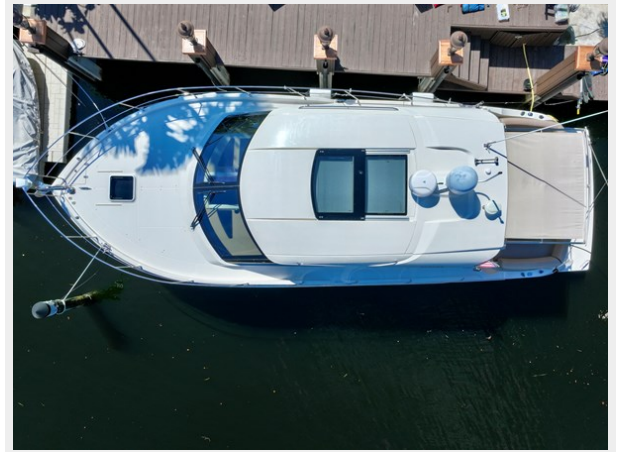
43 CARVER 2015 OVERHEAD