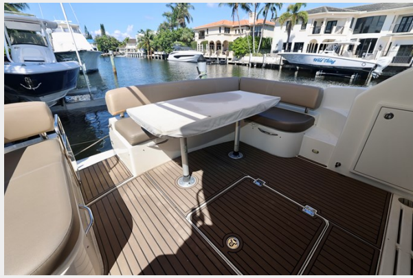
43 CARVER 2015 COCKPIT SEATING