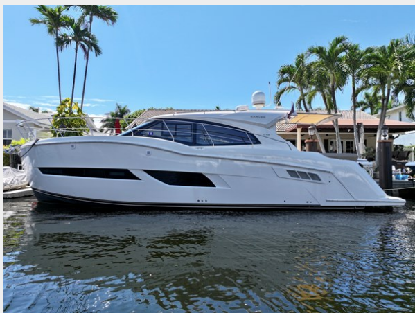
43 CARVER 2015 PROFILE