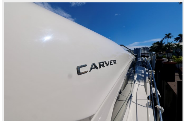
43 CARVER 2015 DETAIL 2