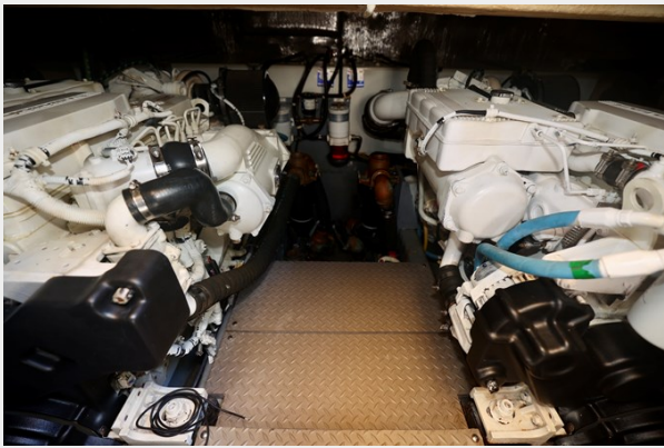
43 CARVER 2015 ENGINE ROOM