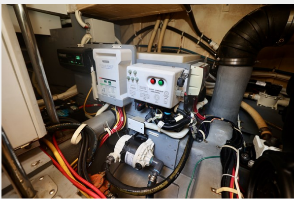
43 CARVER 2015 ENGINE 2