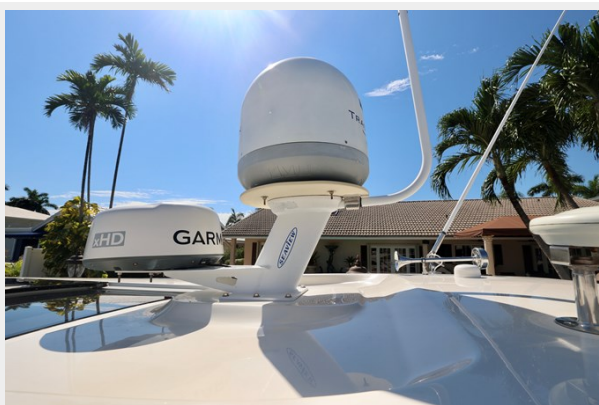
43 CARVER 2015 ELECTRONICS MAST