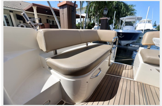
43 CARVER 2015 COCKPIT SEATING 2