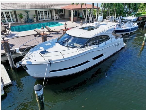
43 CARVER 2015 BOW PROFILE