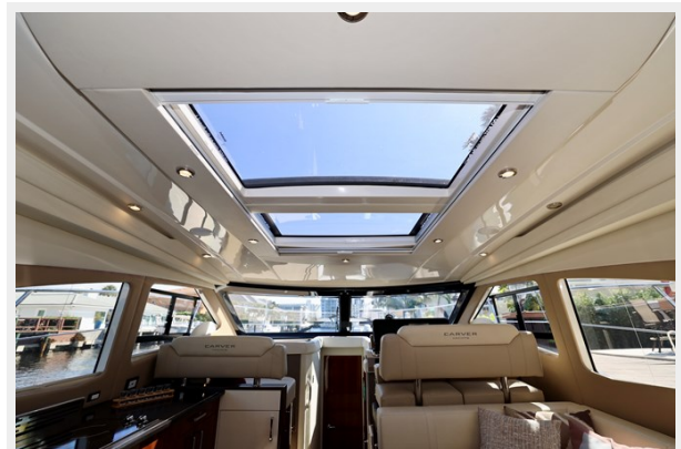
43 CARVER 2015 SALON GLASS ROOF