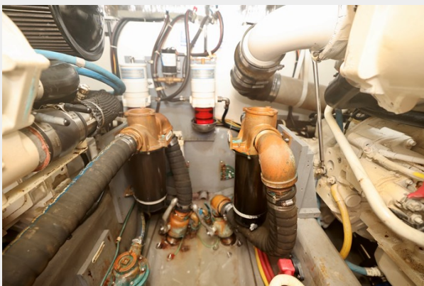
43 CARVER 2015 ENGINE INTAKES