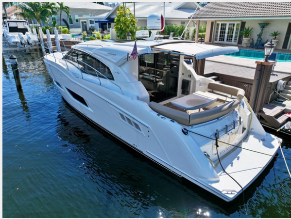
43 CARVER 2015 AFT PROFILE