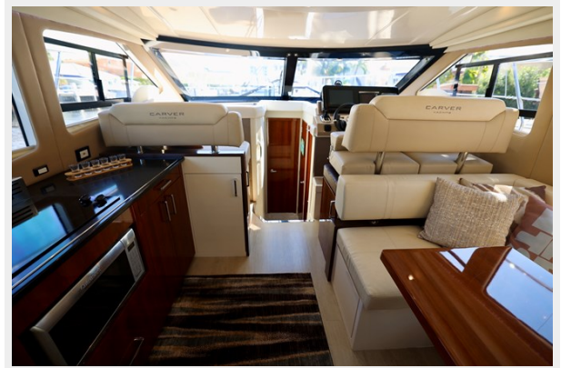
43 CARVER 2015 SALON