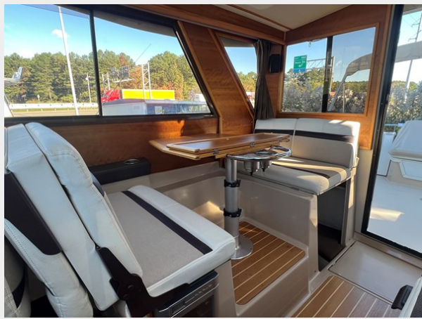
2016 C-28 Dinette