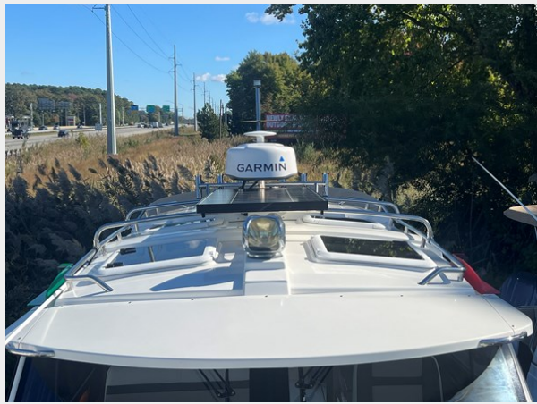
2016 C-28 Cabin top