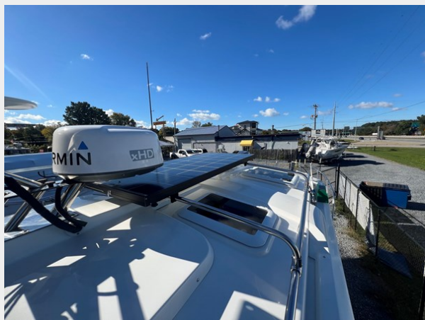
2016 C-28 Radar Array