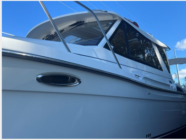
2016 C-28 Exterior