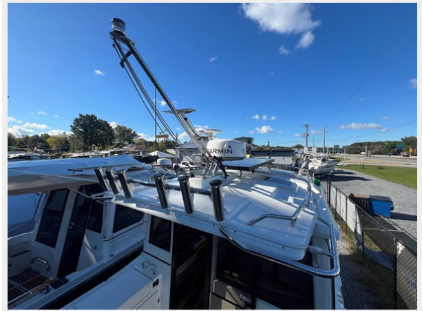
2016 C-28 Radar Mast