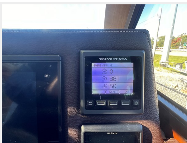
2016 C-28 Engine Hours