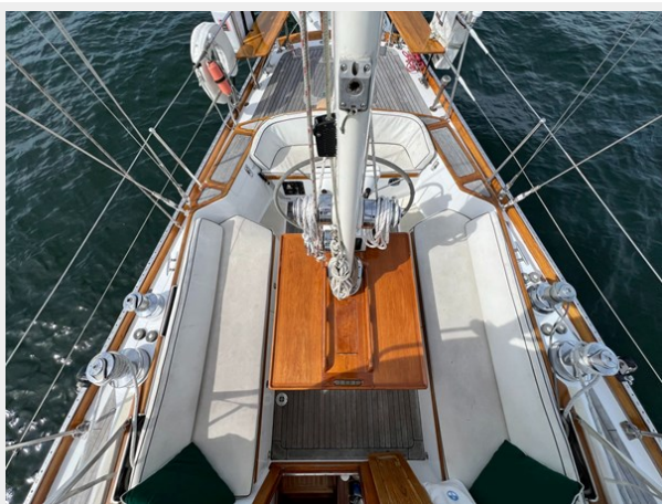
Cockpit from Above