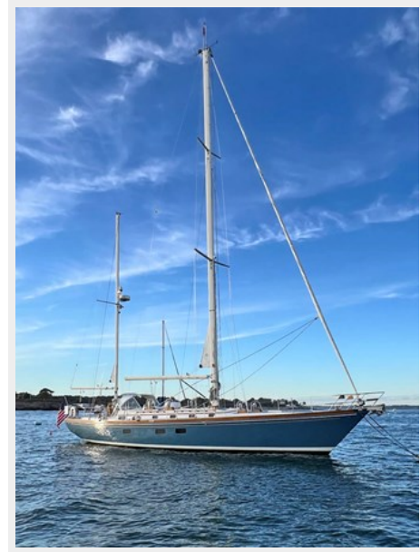
Stb Bow on Mooring