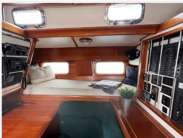
Pilot Berth at Nav Station