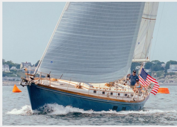
Sailing Stbd Tack