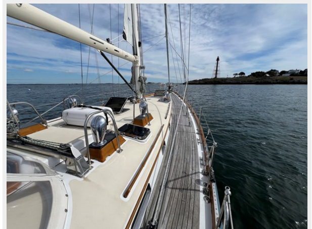
Starboard Side Deck