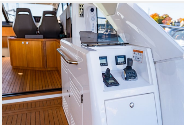
Joystick control station