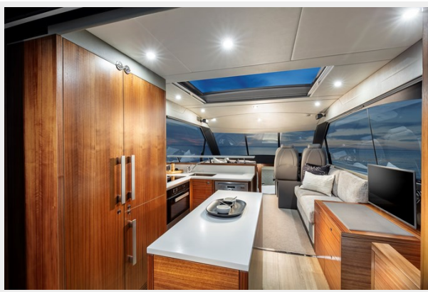
BMS Maritimo galley