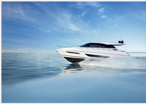
BMS Maritimo X50