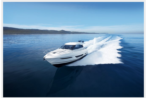
BMS Maritimo X50 Sports Yacht