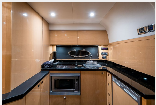
Princess V42 2010