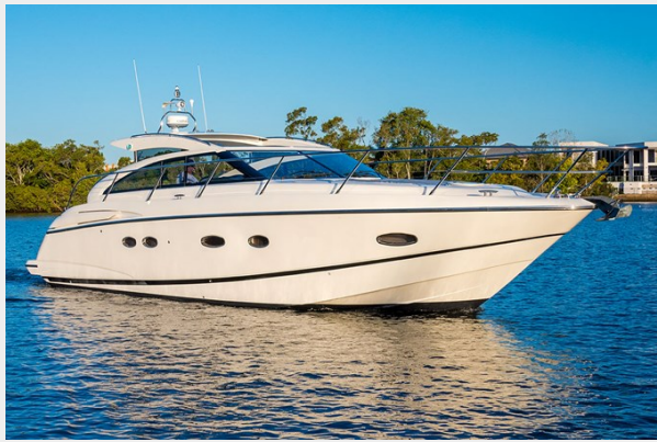
BMS Maritimo Princess