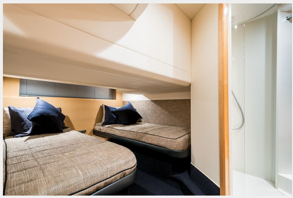
Princess V42 2010