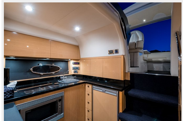
BMS Maritimo Princess