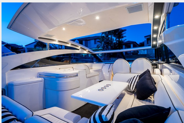
BMS Maritimo Princess