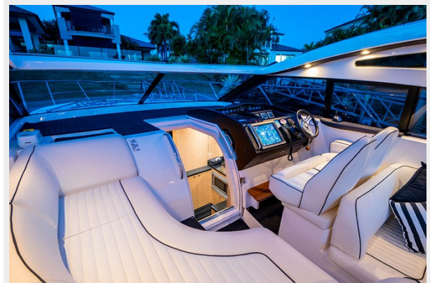
Princess V42 2010