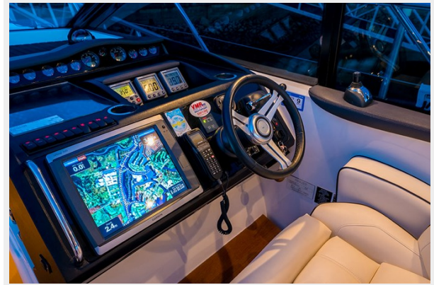
Princess V42 2010