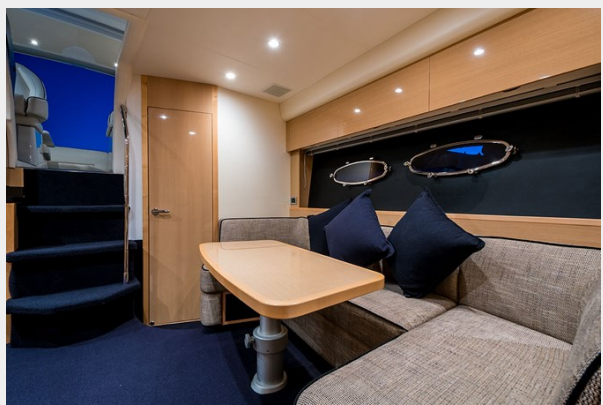
Princess V42 2010