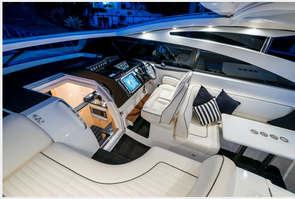
BMS Maritimo Princess