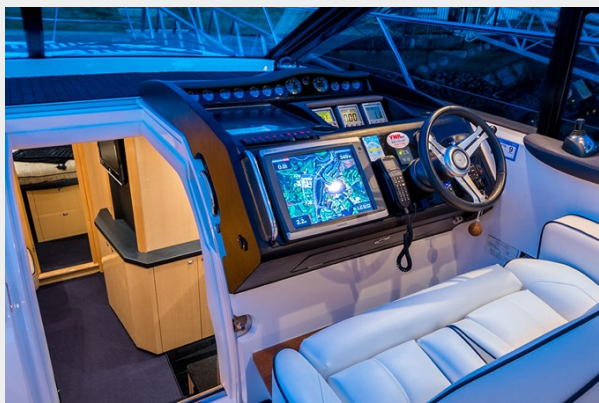
BMS Maritimo Princess