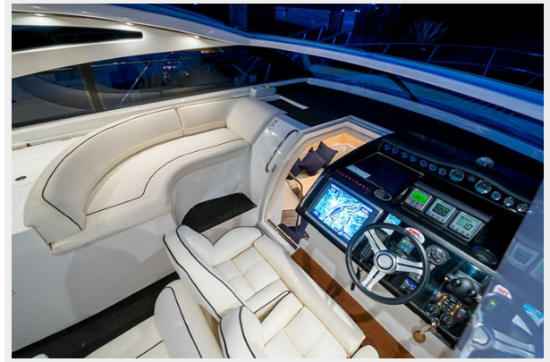
BMS Maritimo Princess