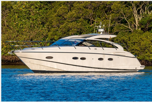
Princess V42 2010