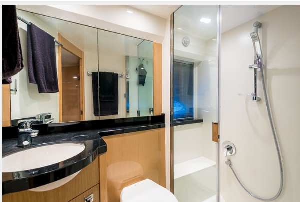
Princess V42 2010