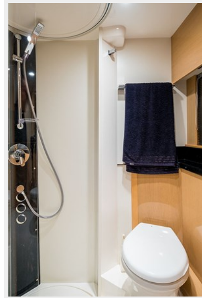
BMS Maritimo Princess