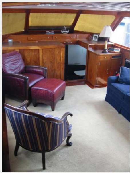
Main Salon Looking Forward