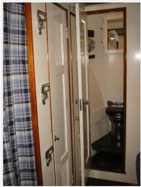
Crew Head/Stall Shower