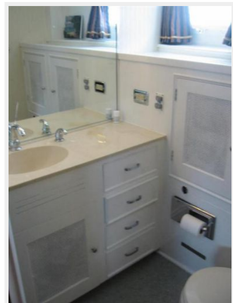
Owner's Stateroom Head