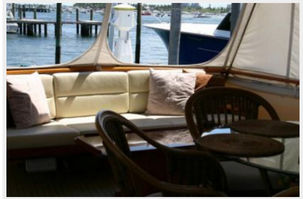
Aft Deck Seating