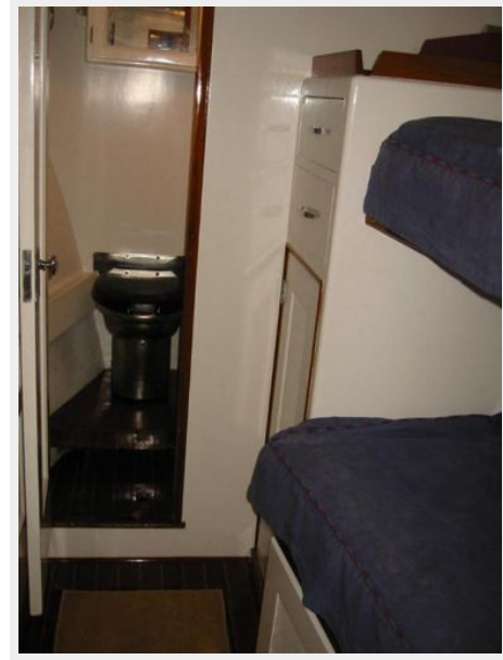
Crew Quarters in Forecastle