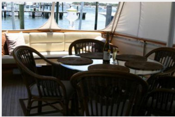
Aft Deck - 1