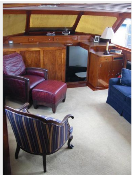
Main Salon Looking Forward