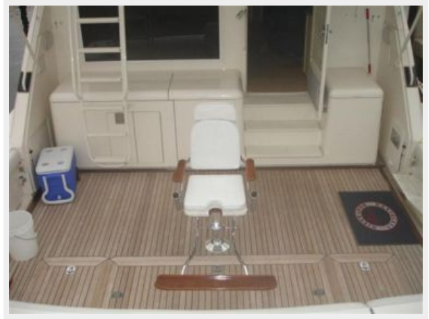
Bait Prep Center