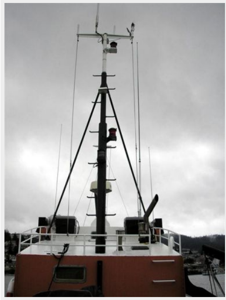
Mast with Ratlines to Lookout