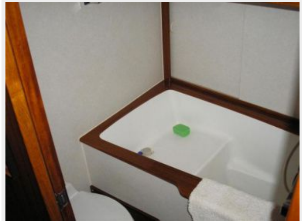
Tub in Master