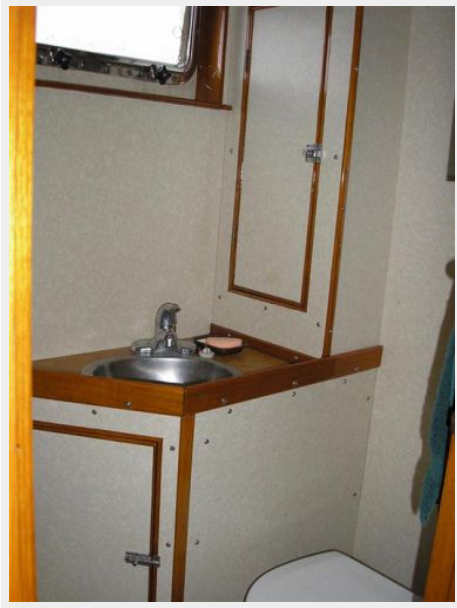
Dayhead in Wheelhouse