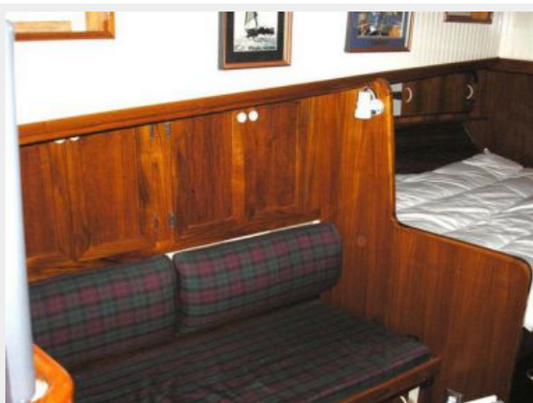
Aft Cabin Settee