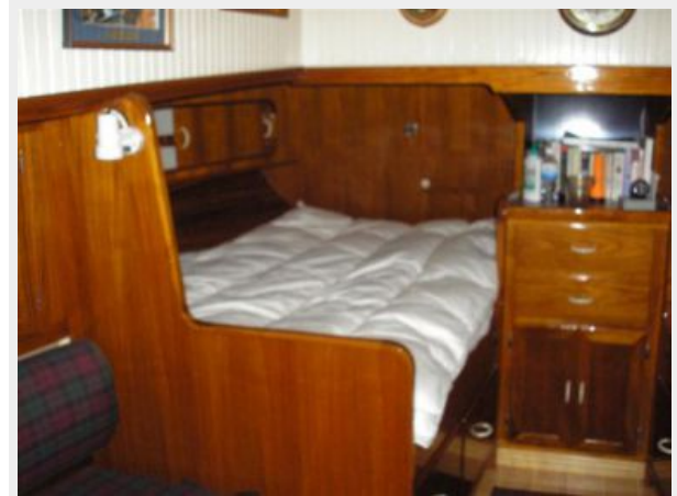
Aft Cabin Port Berth