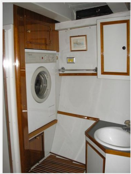
Washer/Dryer in Forward Head