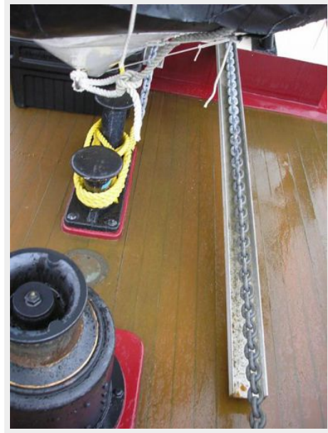
Warping Winch with Dinghy Davits