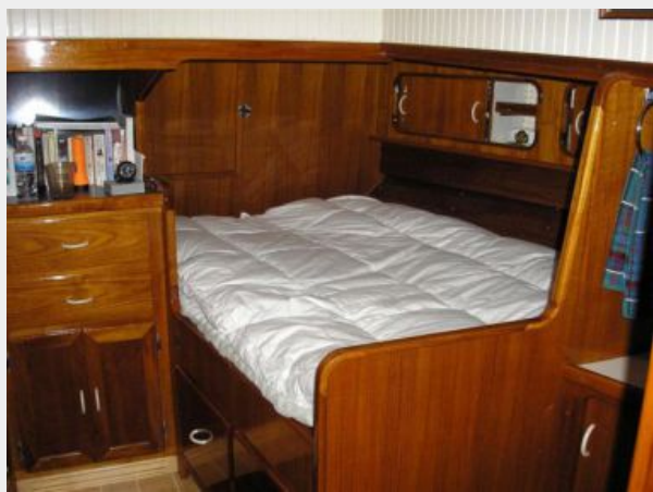
Aft Cabin Starboard Berth