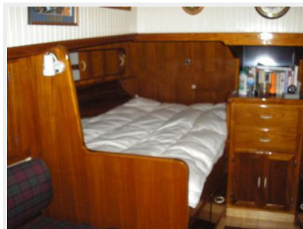
Aft Cabin Port Berth