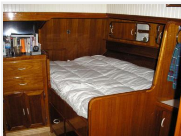
Aft Cabin Starboard Berth