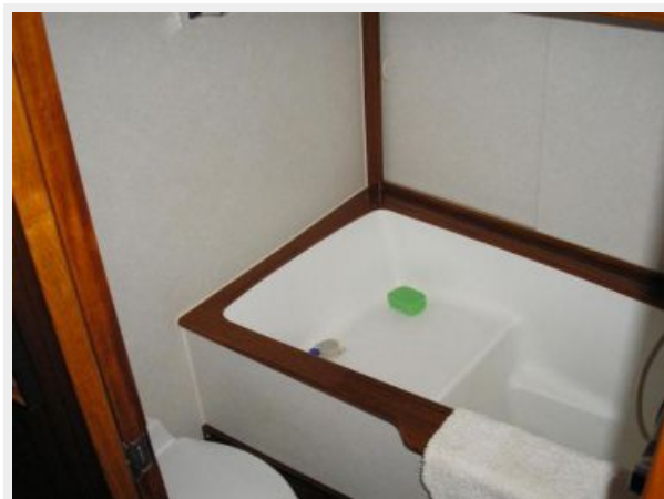
Tub in Master