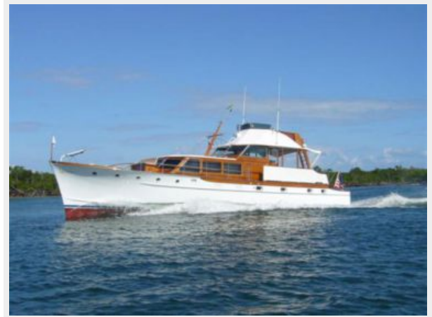
Port Profile, Underway