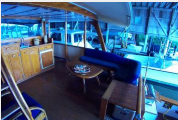
Flushdeck Seating to starboard