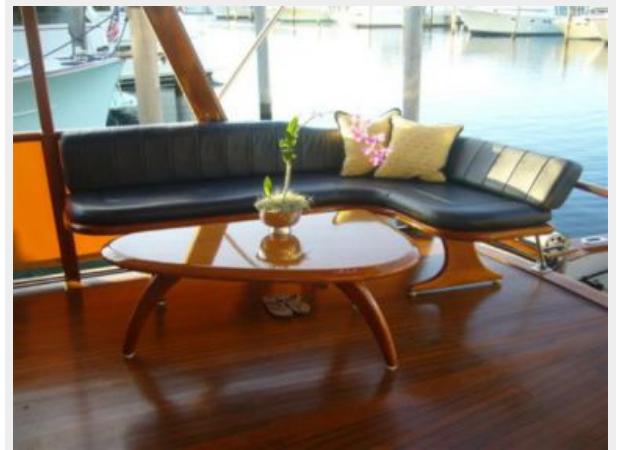
Flushdeck aft starboard L-Settee