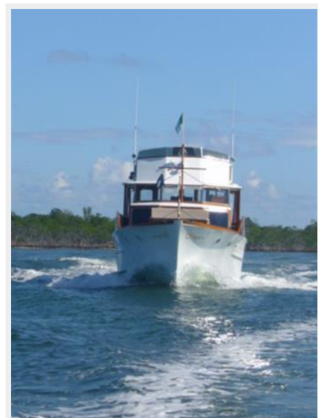
Bow Profile, Underway