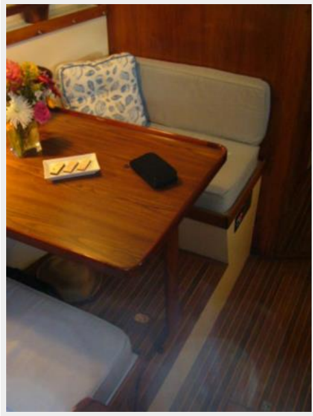
Dinette on port, opposite Galley