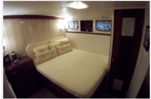
VIP Guest Stateroom