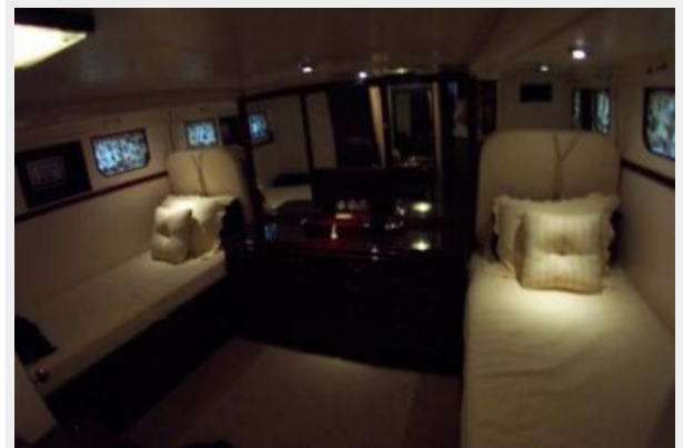
Master Stateroom with twin berths