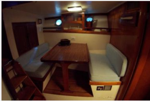
Dinette on portside opposite Galley