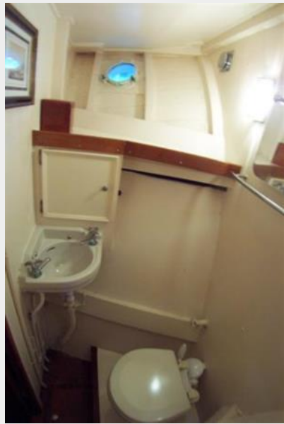
Crew Head with Sink