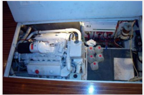
Port Engine Saloon Hatch