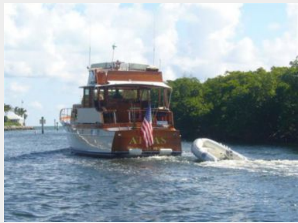
Stern Profile, Underway