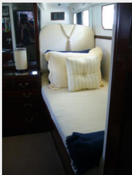
MSR port single berth