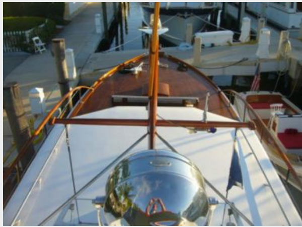
View of Foredeck from Flybridge