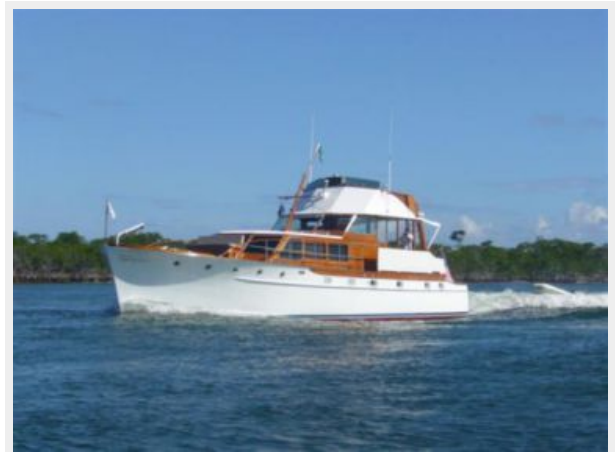
Bow Profile, Underway