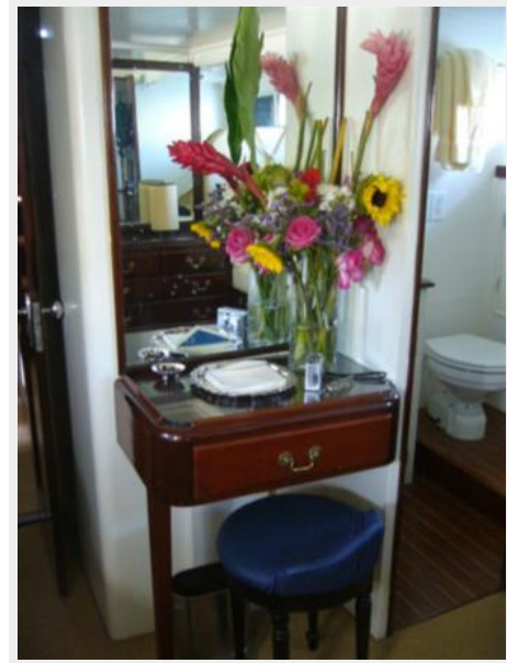
VIP Guest Stateroom