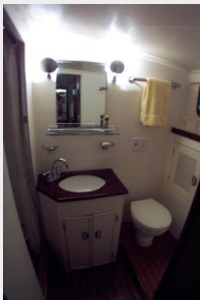
MSR Ensuite Shower