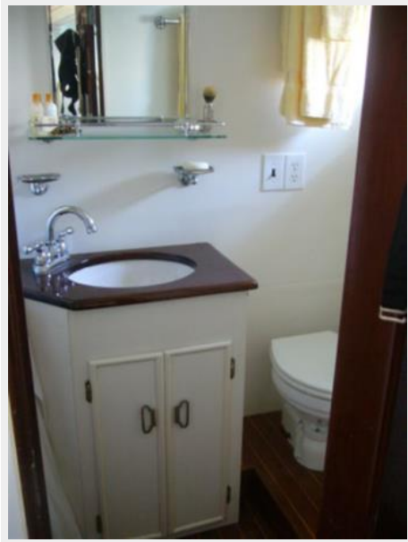
MSR Vanity Desk