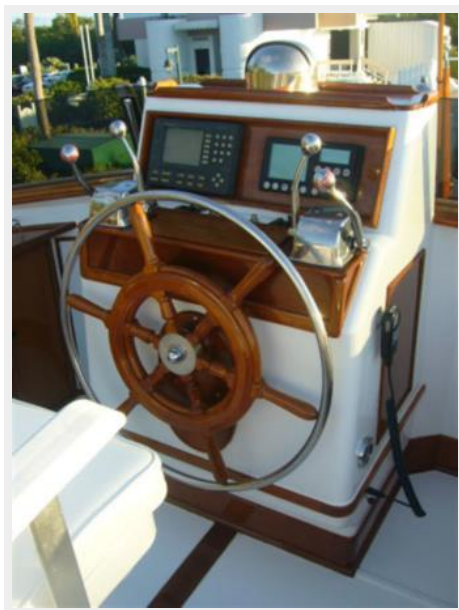
Lower Helm Navigation and Instruments