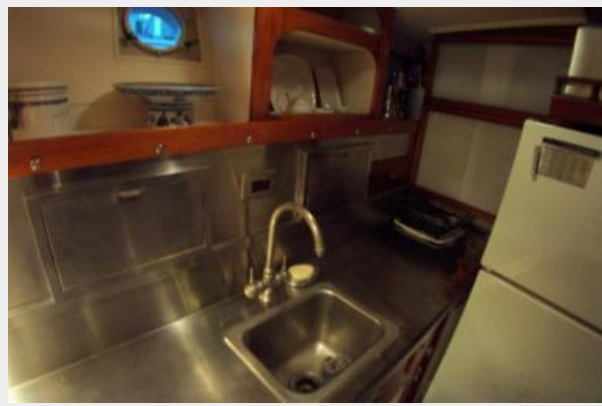
Crew Quarters forward