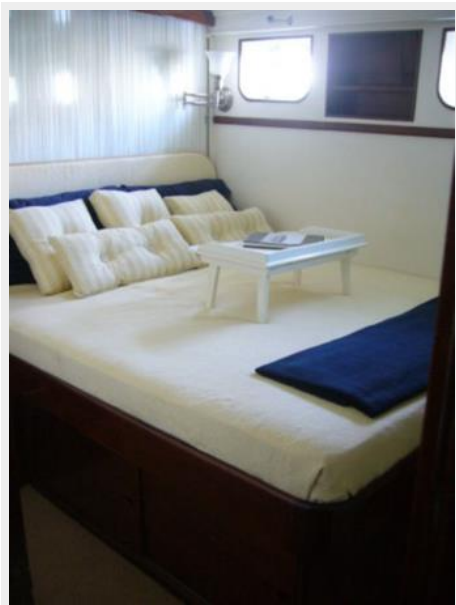
Nightstand in VIP Guest Stateroom