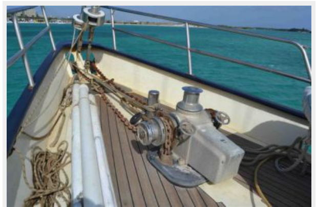
New teak deck