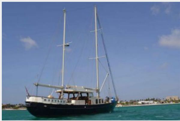
custom motorsailer for sale