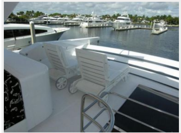
Flybridge Lounge Seats