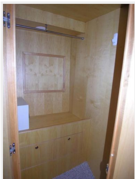
VIP Stateroom Closet