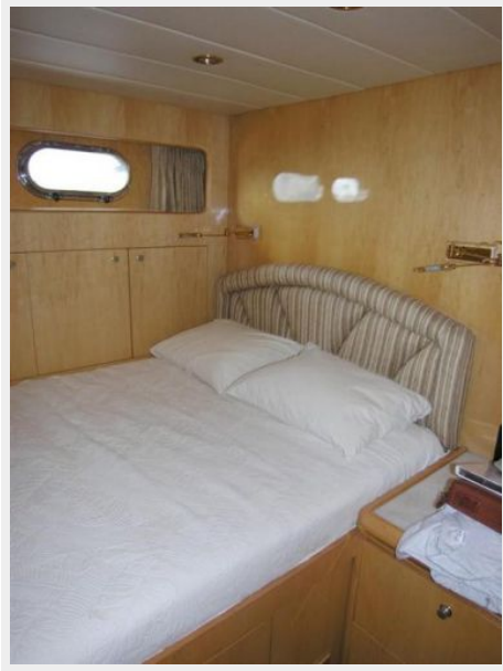
Double Guest Stateroom