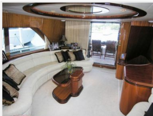
Main Salon Aft