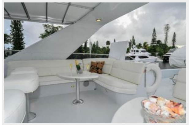
single staircase=larger aft deck dining