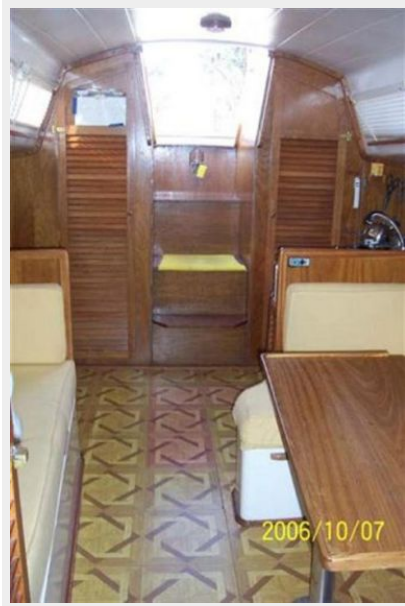
Cabin Aft View