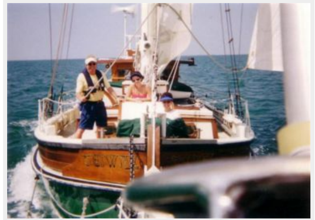
Bow Looking Aft