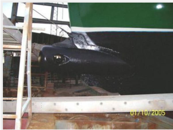
Hydraulic Bow Thruster in Custom Bow Nacelle