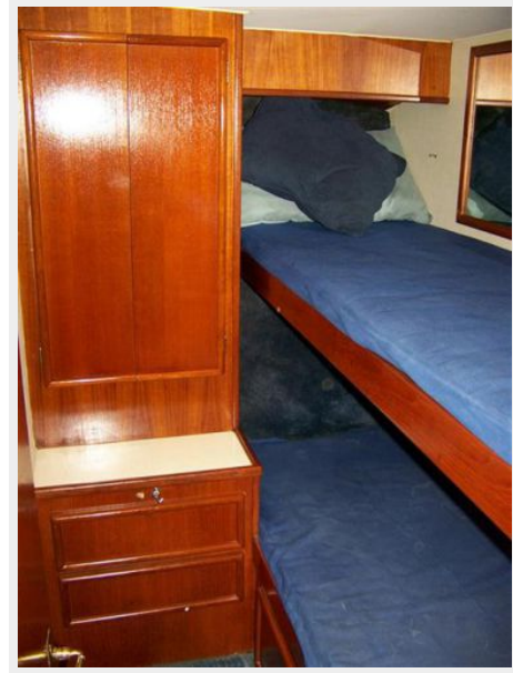
Sink and Cabinets