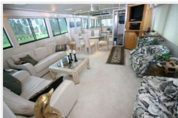
Salon forward view