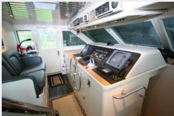
Spiral Stairs to Flybridge