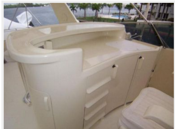
Flybridge aft view