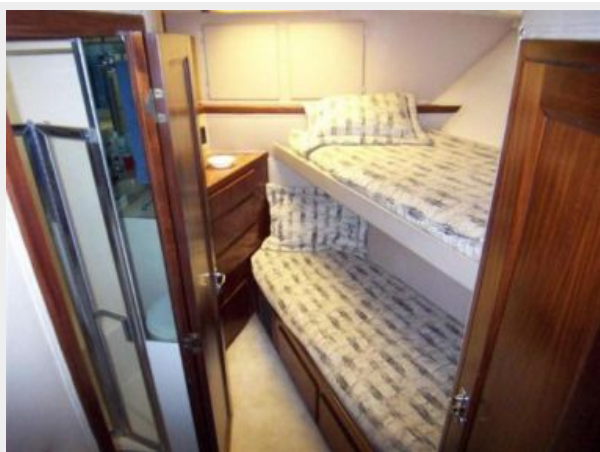
Guest stateroom mid