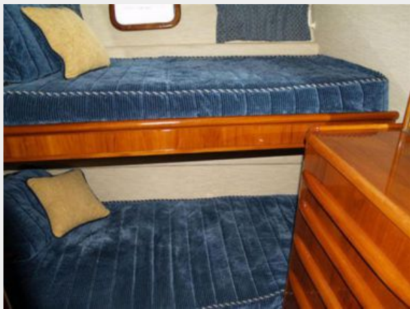
Wide Guest Upper / Lower Bunks