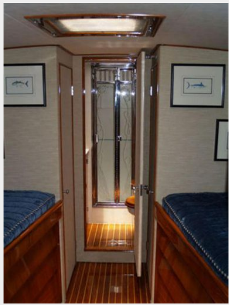
Entrance to Main Cabin Head