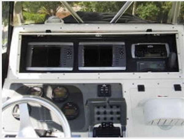
Lockable Electronics Box