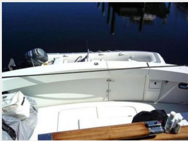
Cockpit and Dinghy