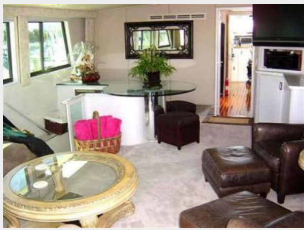
Salon - Forward Port Side