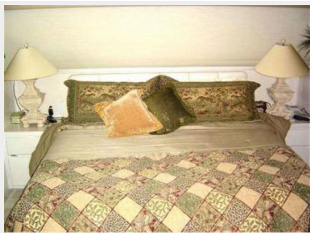
Master Stateroom - King Centerline