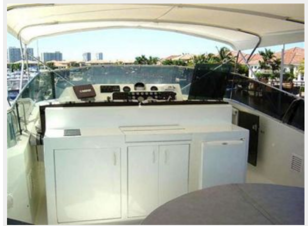
Flybridge - Forward