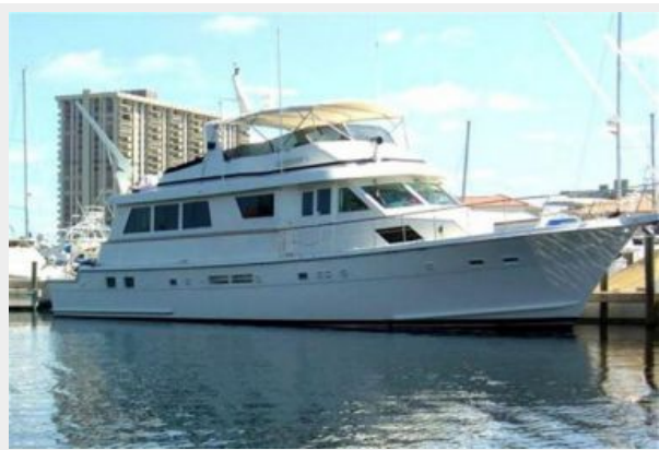
Docked - Starboard Forward View