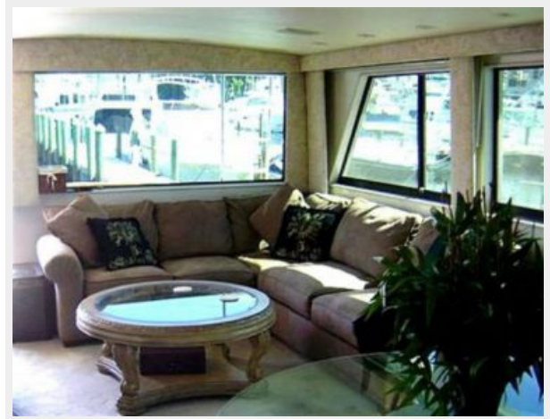
Salon - Aft Port Side