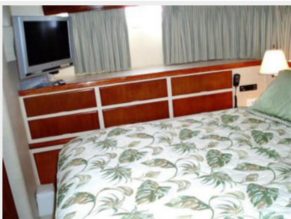
Master Stateroom Starboard