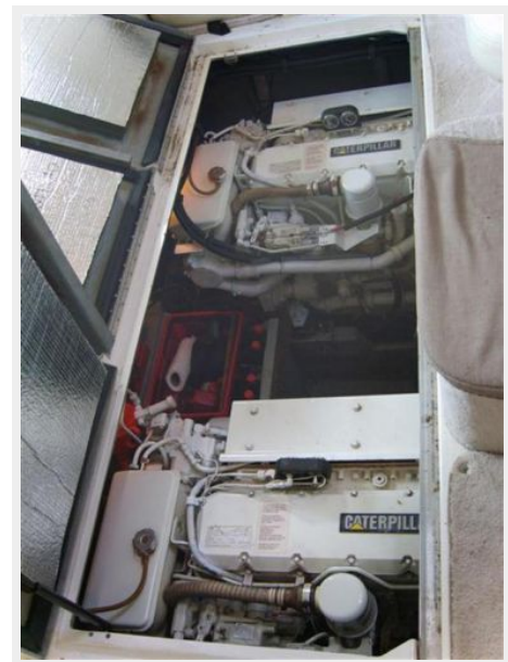
Engine Room 3