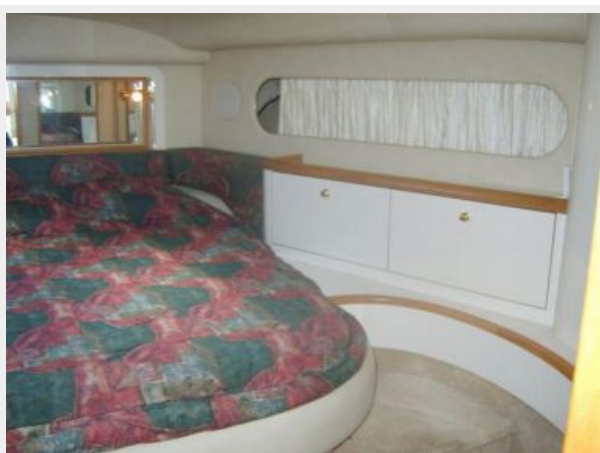
Master SR 1