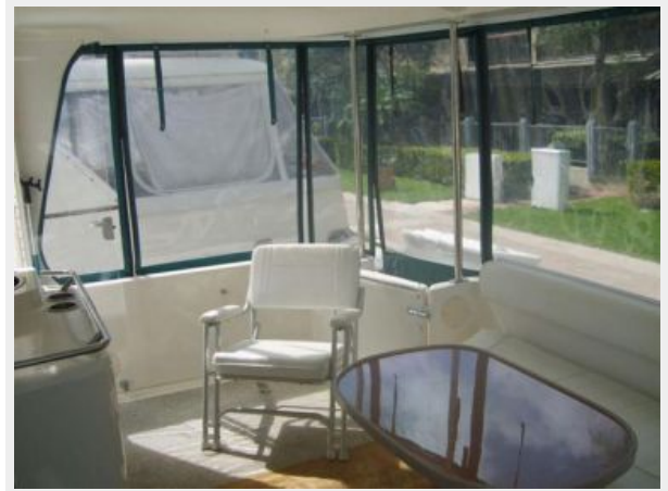
Aft Deck 2