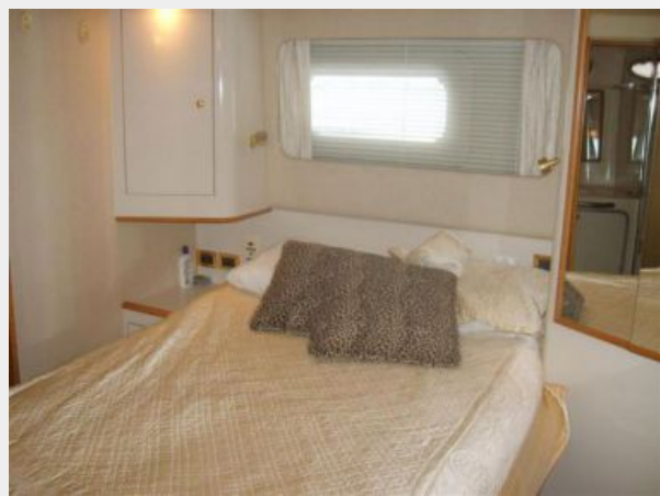
Guest SR 1