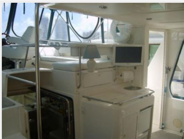
Aft Deck Wet Bar