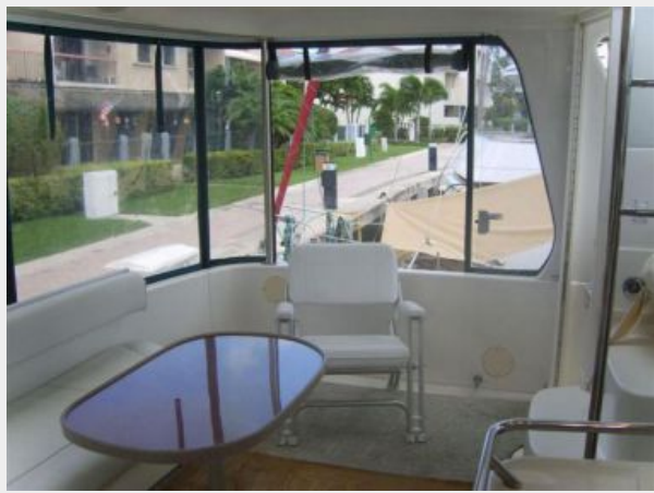
Aft Deck 1