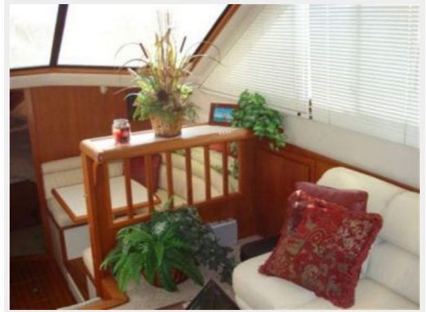
Salon to Starboard