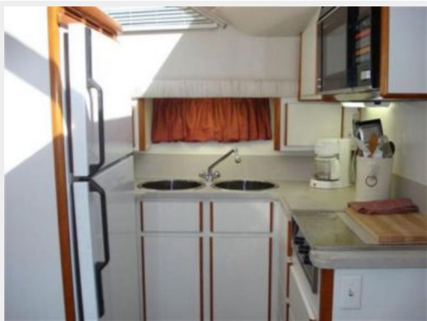
Galley to Port