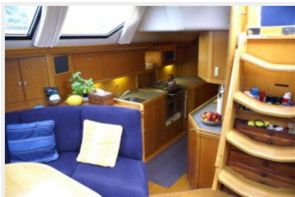
Port Side Salon