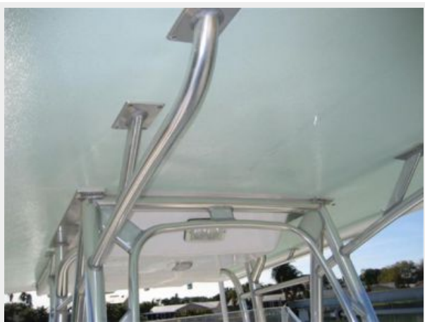
HARDTOP & BOX