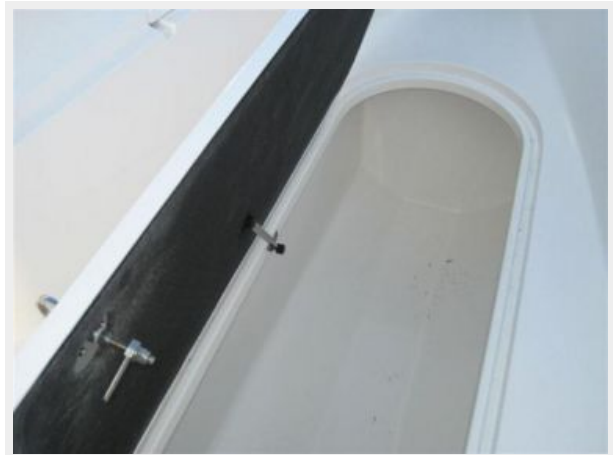
FORWARD FISH BOX