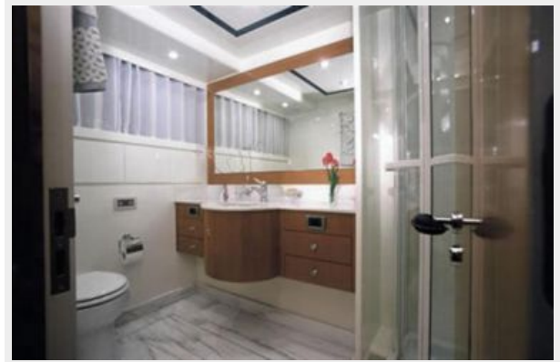
Main Deck Master