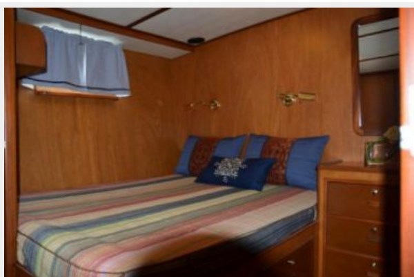
Port Guest Cabin