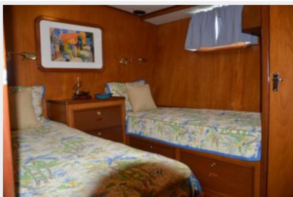
Starboard Guest Cabin