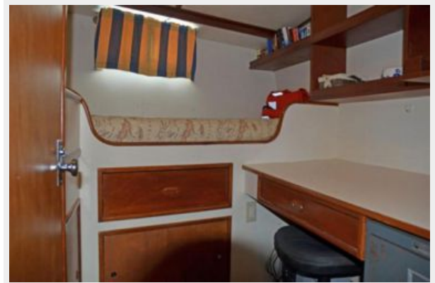
Crew Cabin & Office