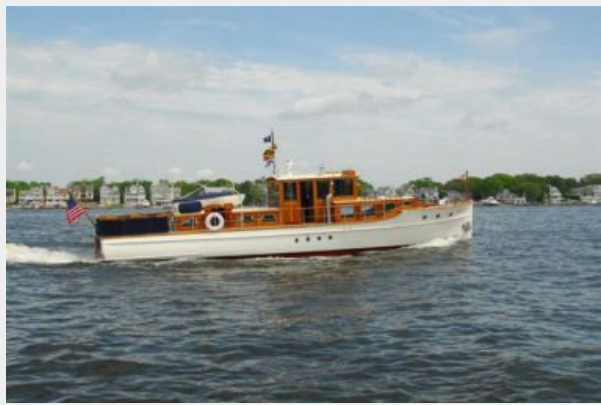
Side profile starboard