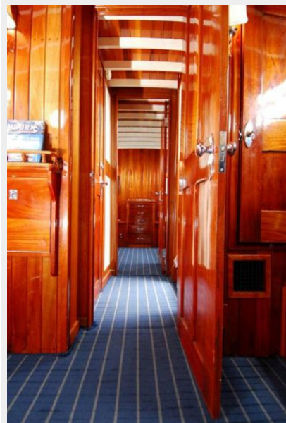
Companionway looking forward