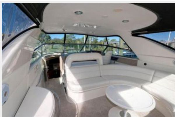
Cockpit Seating and Hardtop