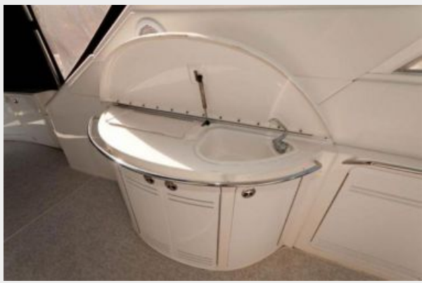
Cockpit Wet Bar