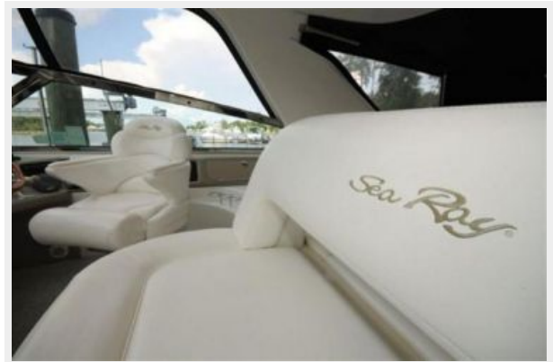
Helm Companion Seating