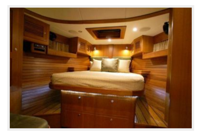
Forward Guest Stateroom