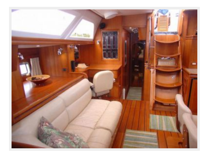
Stbd Main Salon, Looking Aft