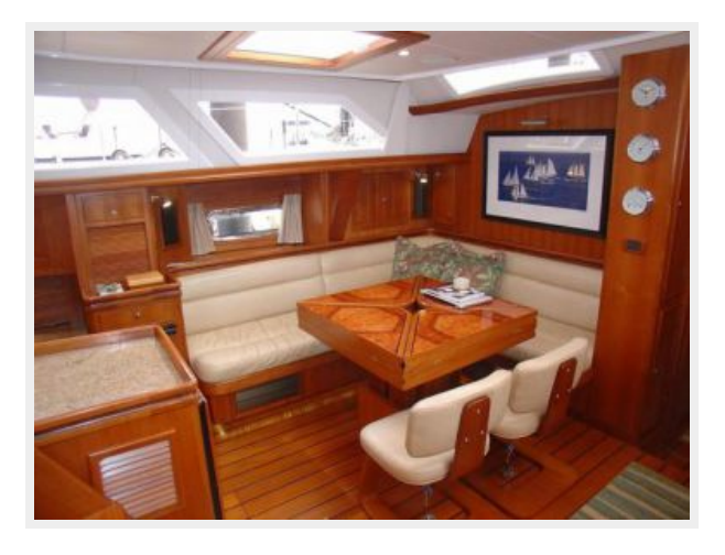
Port Salon, Table Closed