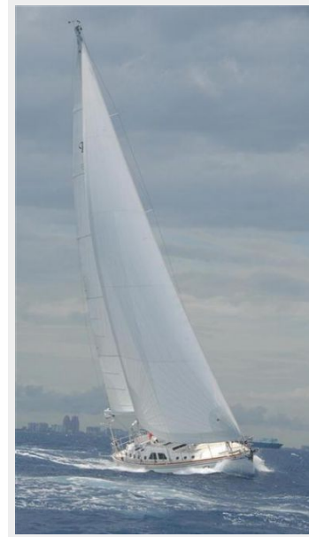
Sea Trial 2007 (before hull was painted)