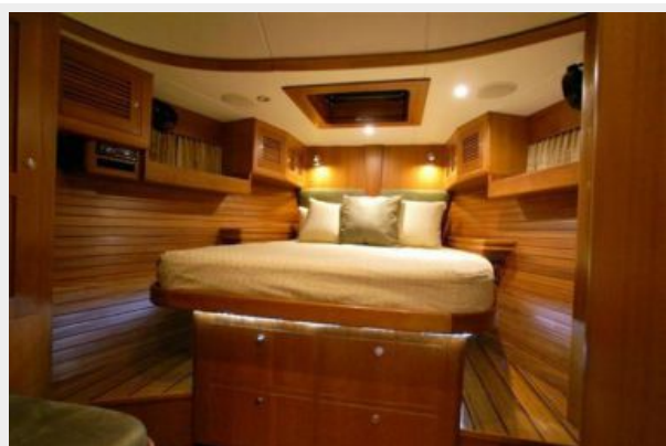
Forward Guest Stateroom