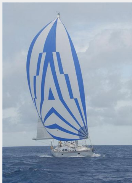
Under Spinnaker 2007