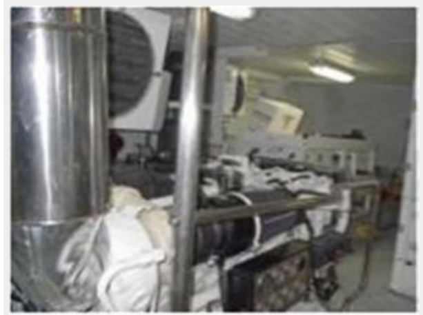
Engine Room 2