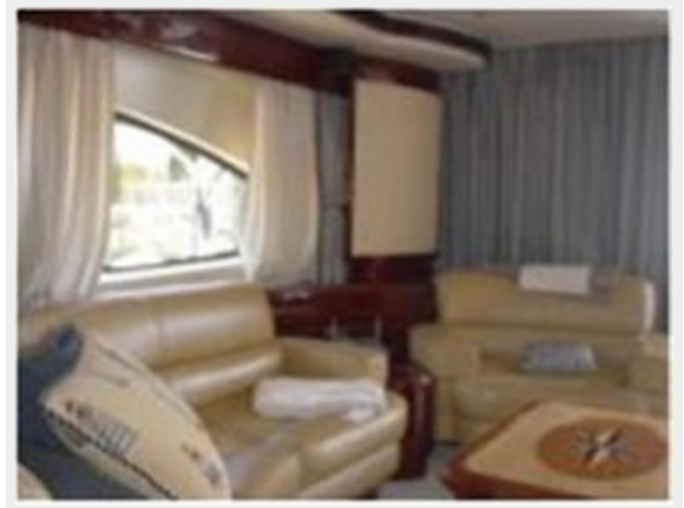
Main Salon 2