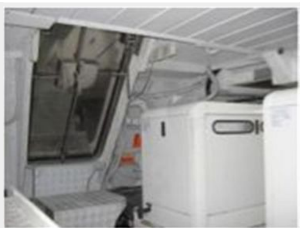
Engine Room 3