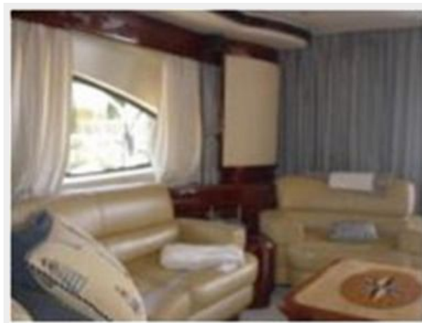
Main Salon 2