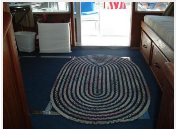
Salon - Engine Hatch