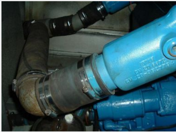
Port Motor Exhaust Tubes