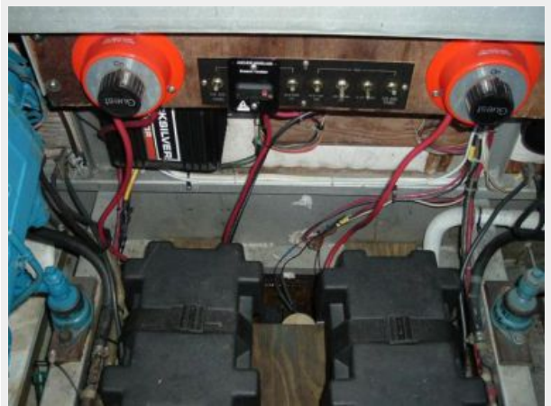
Batteries & Switches