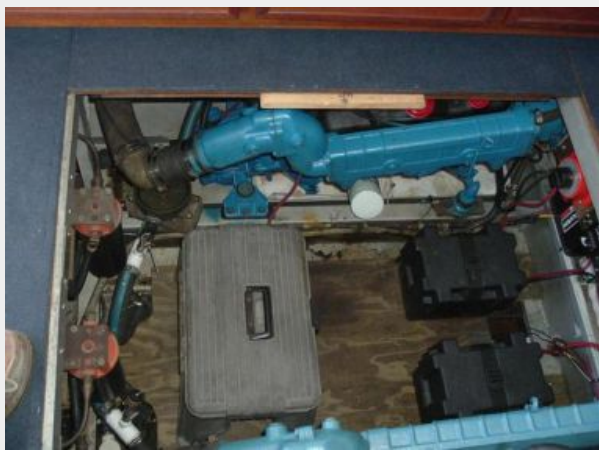
Manifold Port Motor