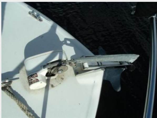
Windlass & Plow Anchor