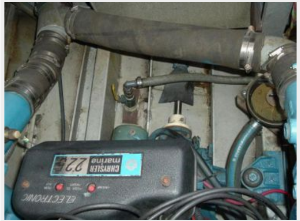
Starboard Exhaust Tubes & Prop Shaft