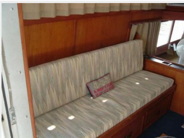
Salon Bench Seat