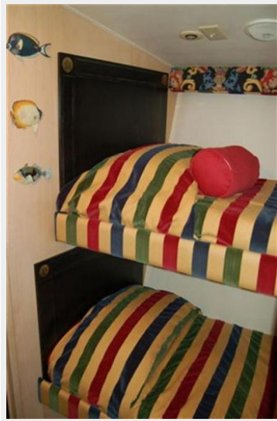
Guest Stateroom Head Wallcovering