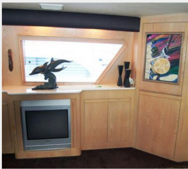
Entertainment Center in Salon