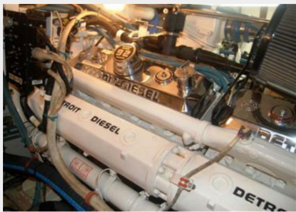
Starboard Engine 2