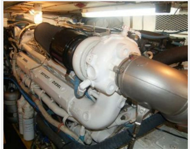
Starboard Engine 2