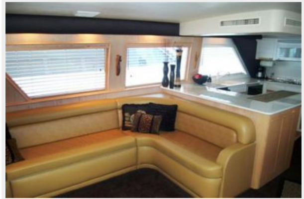
Salon looking Port