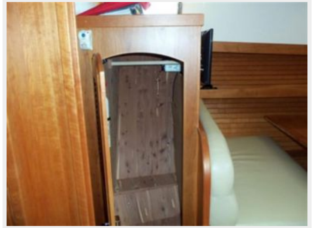
Larger hanging locker