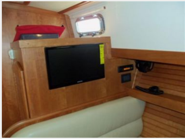
TV, Second Stateroom