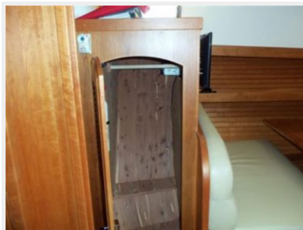
Larger hanging locker