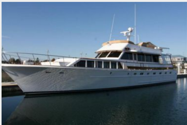
AT THE DOCK