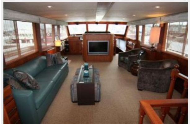
MAIN SALON LOOKING FORWARD