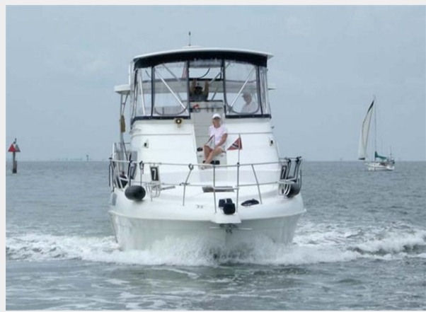
NEW HARDTOP, NEW STRATOGLASS ENCLOSURE