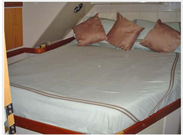
Master Stateroom, TV, Hanging Locker