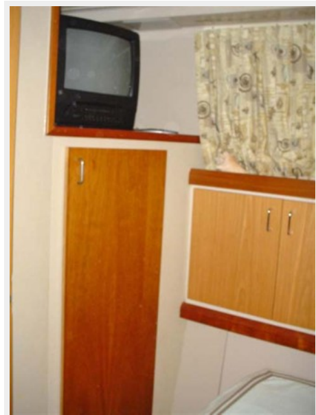
Master Stateroom, TV, Hanging Locker