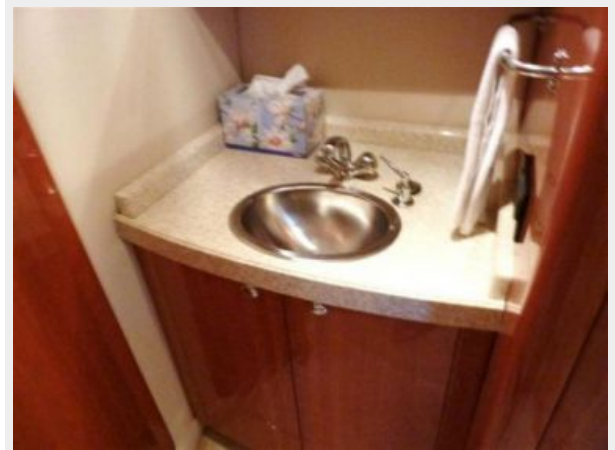
Aft Cabin Sink