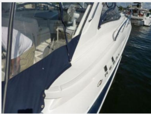
Regal Port Side