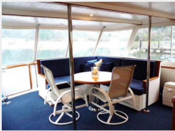
aft deck aft view