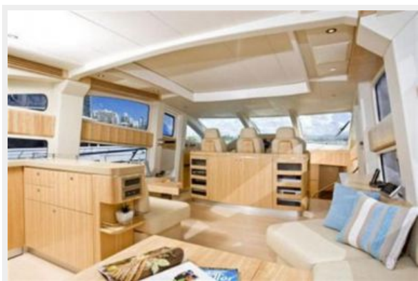
MAIN SALON TO HELM