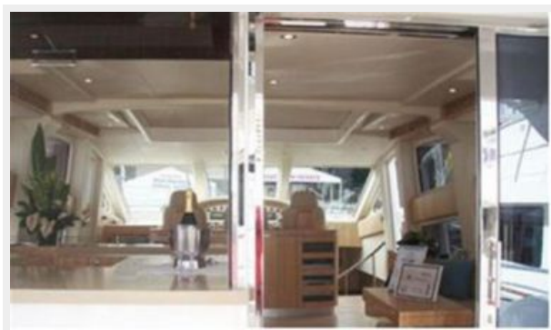
OPEN AND LIGHT