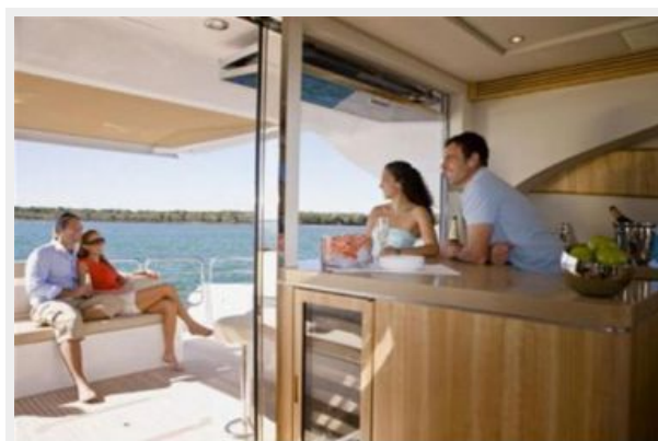
GREAT AFT DECK ACCESS