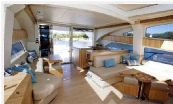
MAIN SALON AND UPPER GALLEY