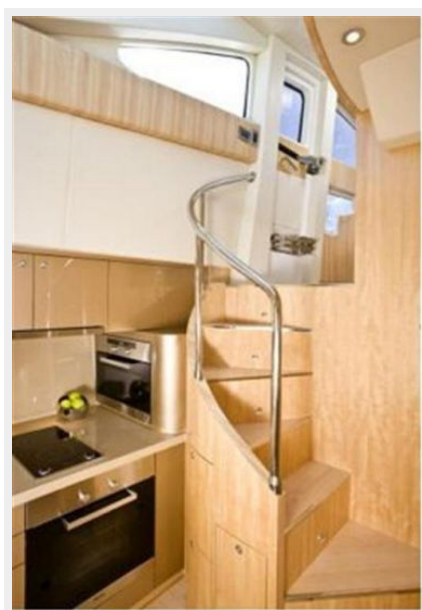
LOWER GALLEY TO STARBOARD