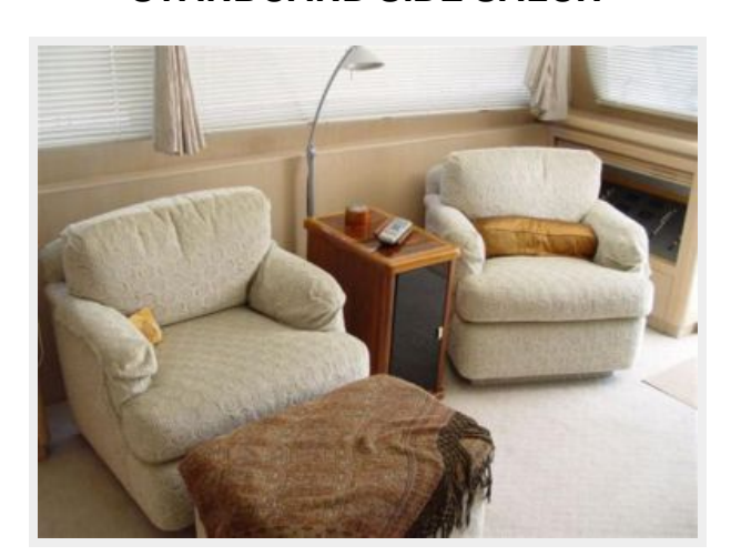
STARBOARD SIDE SALON