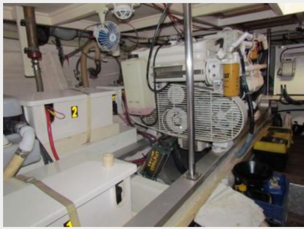
Engine Room Starboard