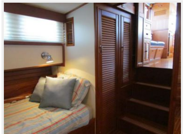
Master Hanging Locker