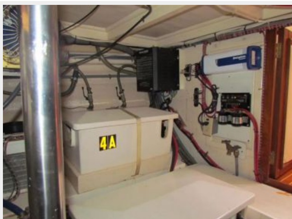
Engine Room Forward Port