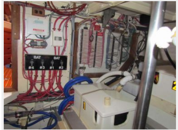
Engine Room Wiring