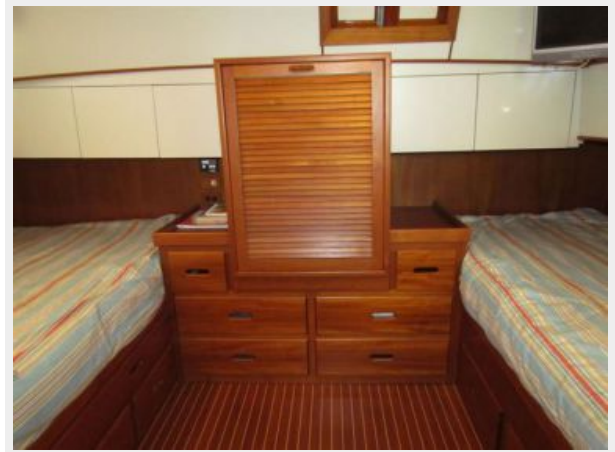
Master Bureau WD Cabinet