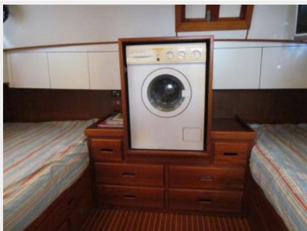
Master Bureau Washer Dryer