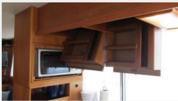
Galley Drop Down Dish Locker