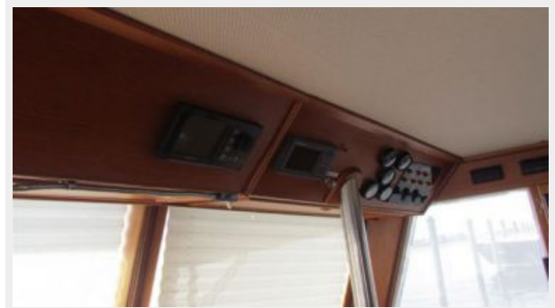
Helm Overhead Electronics