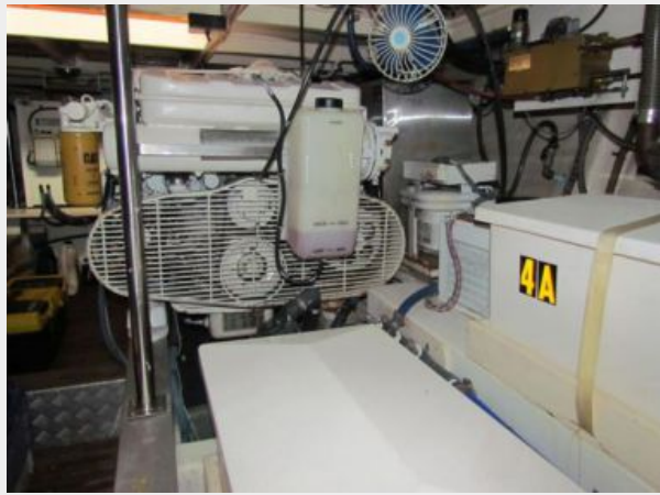
Engine Room Aft