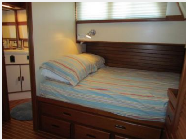
Master Double Berth