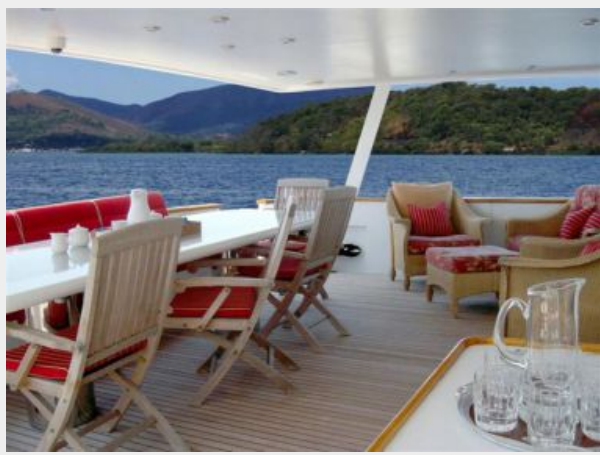
Open aft deck